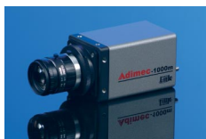
Adimec-1000m 1004x1004@50 fps

Member of a fully compatible product family sharing a common mechanical, optical, hardware and software interface